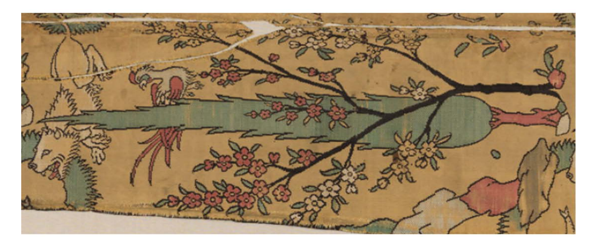
Figure 14: Iranian Textile Fragment, 16th century.