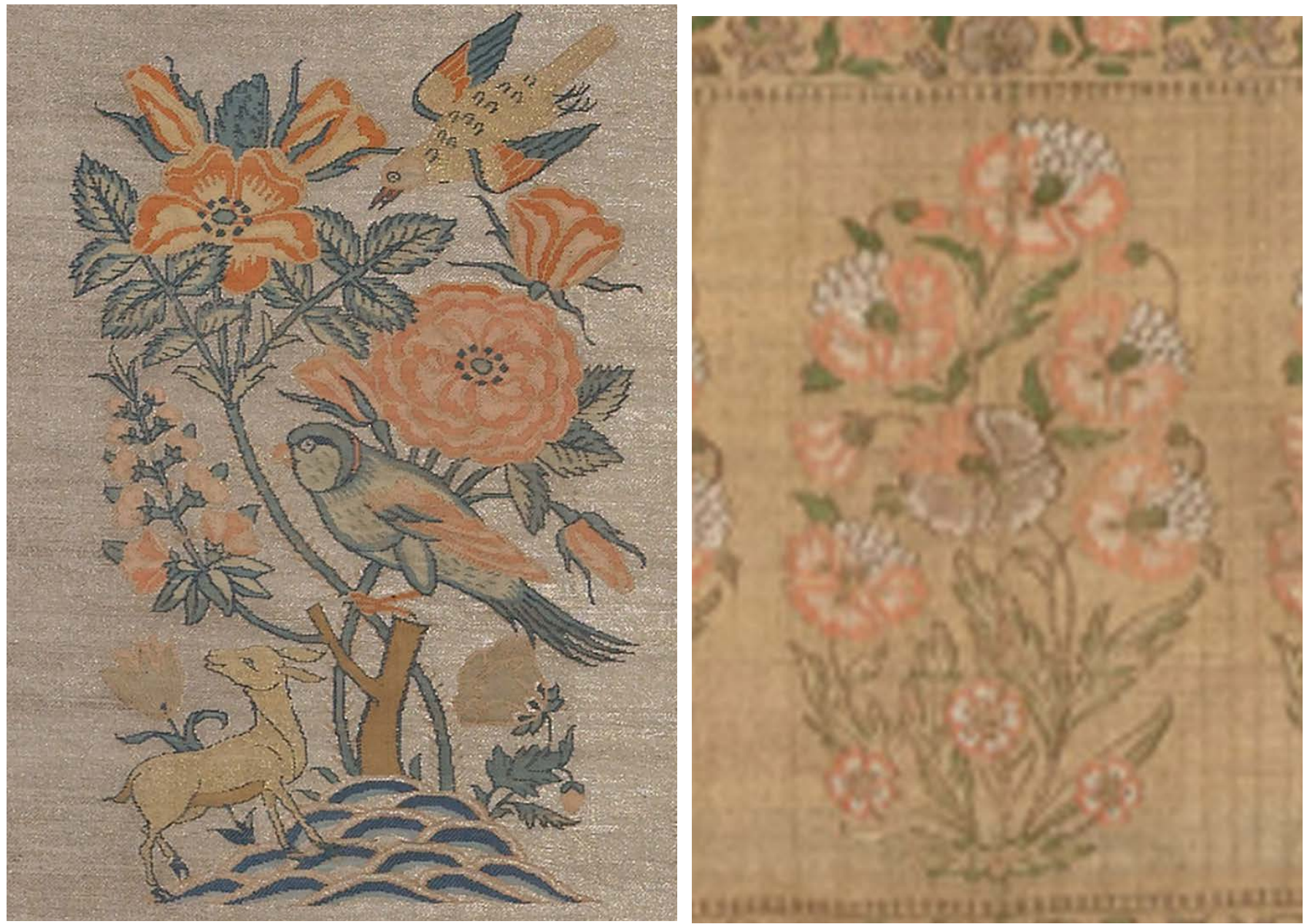
Figure 9 : Silk Panel dates to late 17th-early 18th