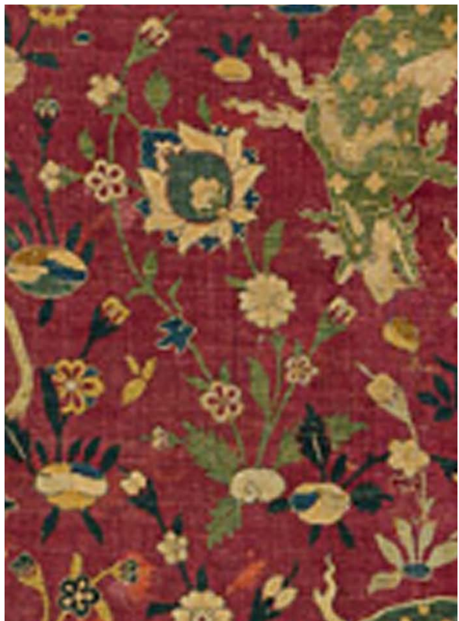
Figure 6: Silk Animal Carpet, second half 16th century

Golden Flower Challenge by Esra Alhamal www.islamicillumination.com | Mar 2020