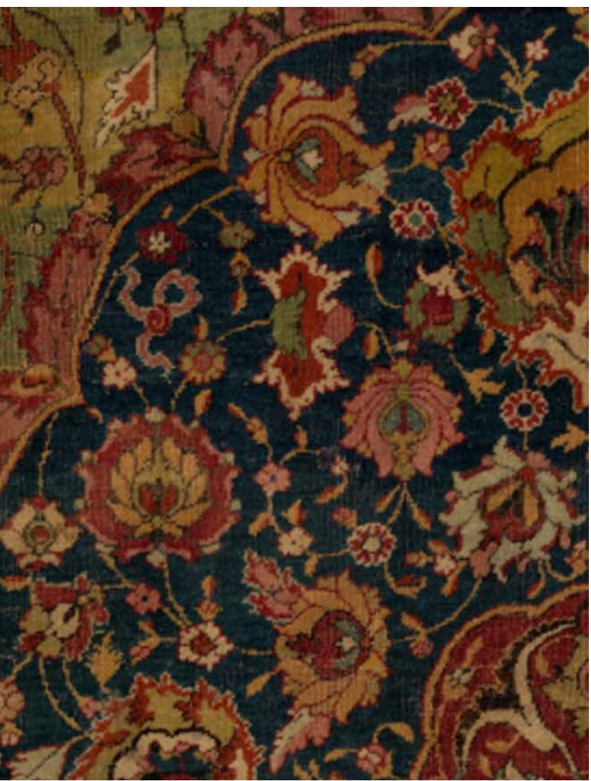
Figure 8: The Seley Carpet, late 16th century