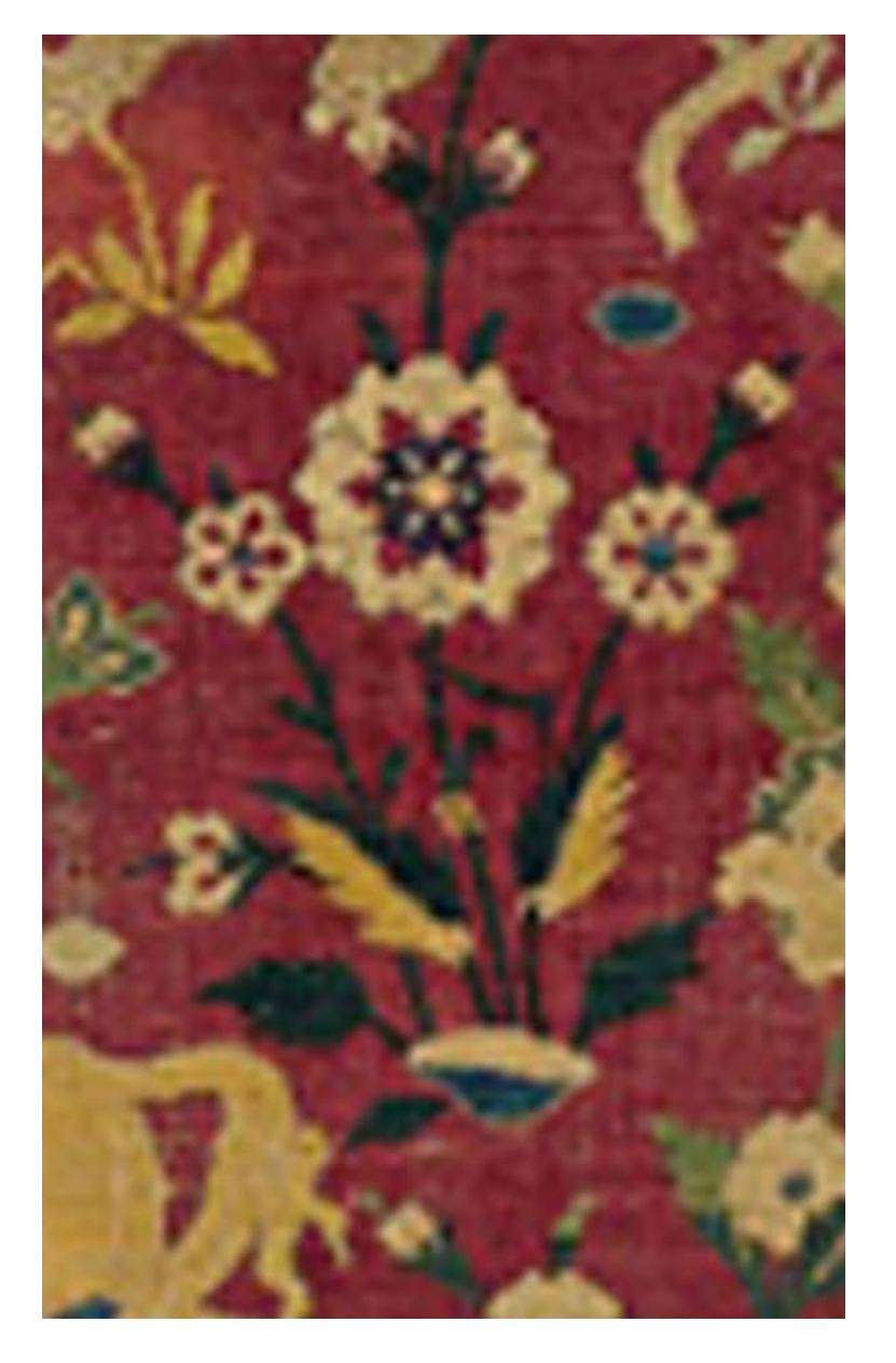
Figure 1 : Silk Animal Carpet, second half 16th century