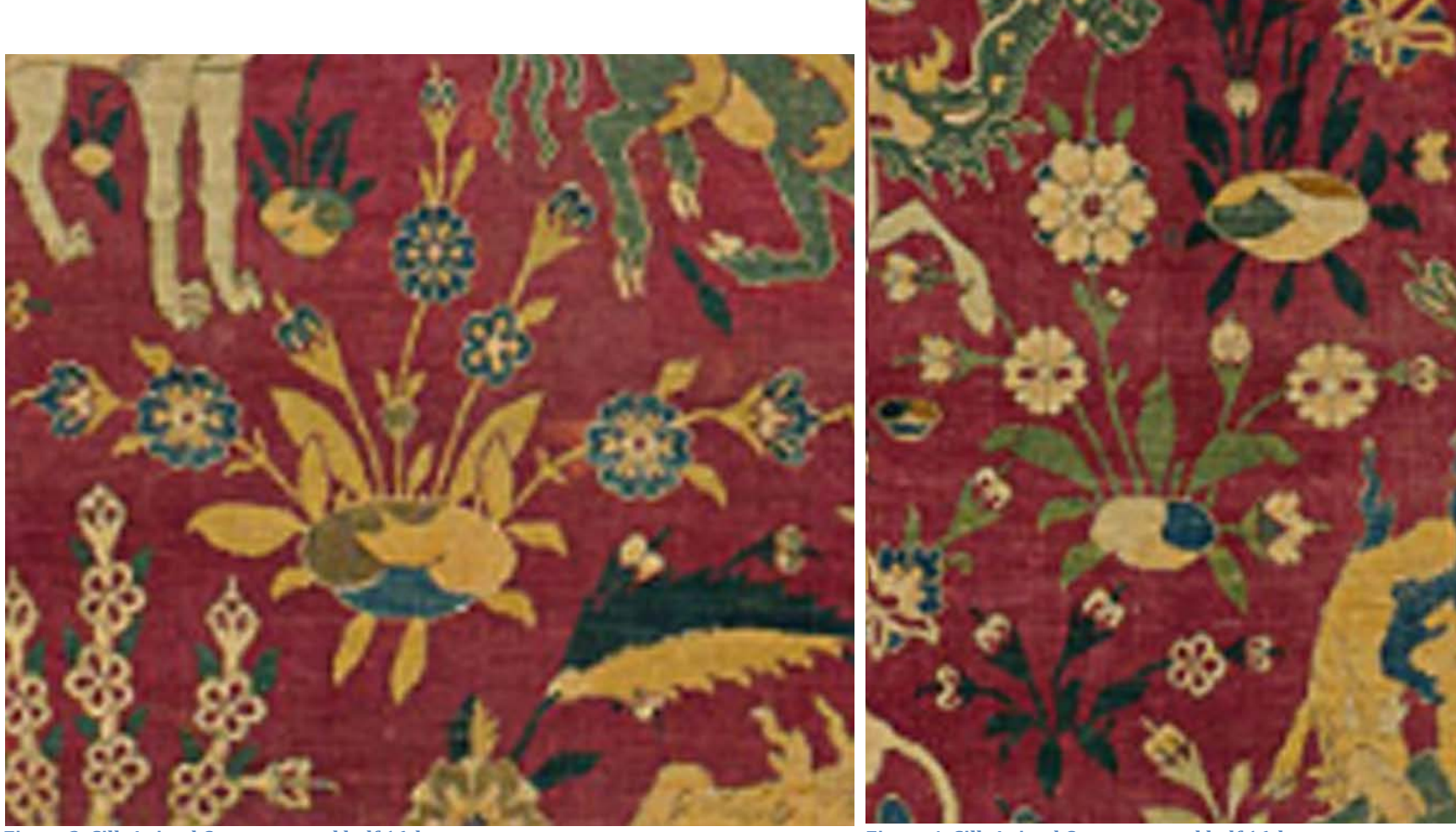
Figure 3: Silk Animal Carpet, second half 16th century