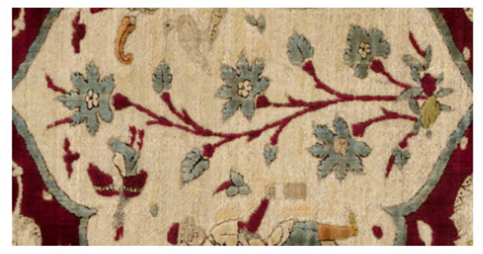
Figure 13: Woven Safavid fabric inspired by book illustration, mid-16th century.