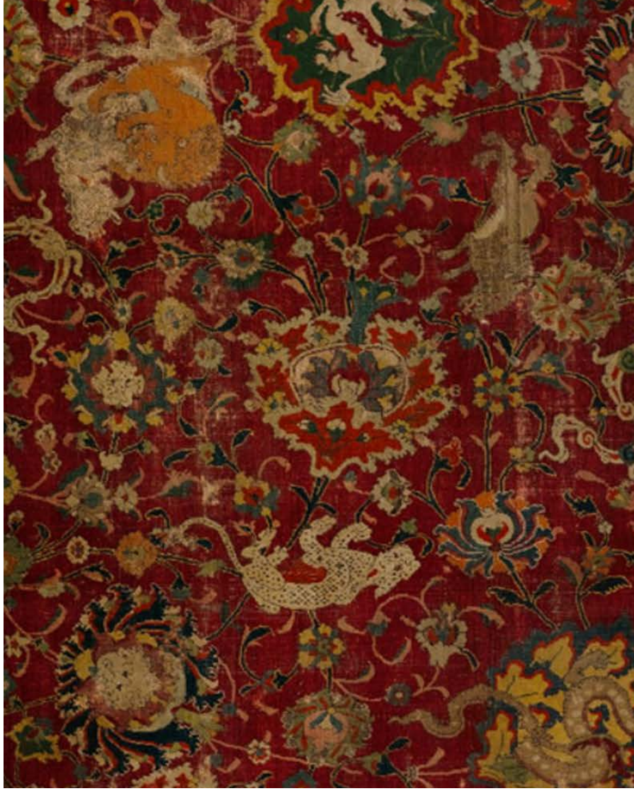
Figure 7: The Emperor's Carpet, second half 16th century