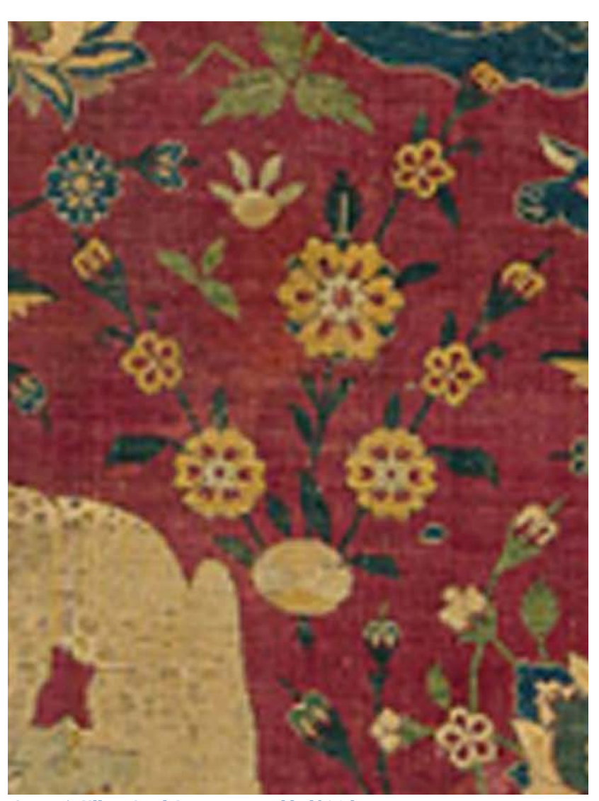
Figure 5: Silk Animal Carpet, second half 16th century