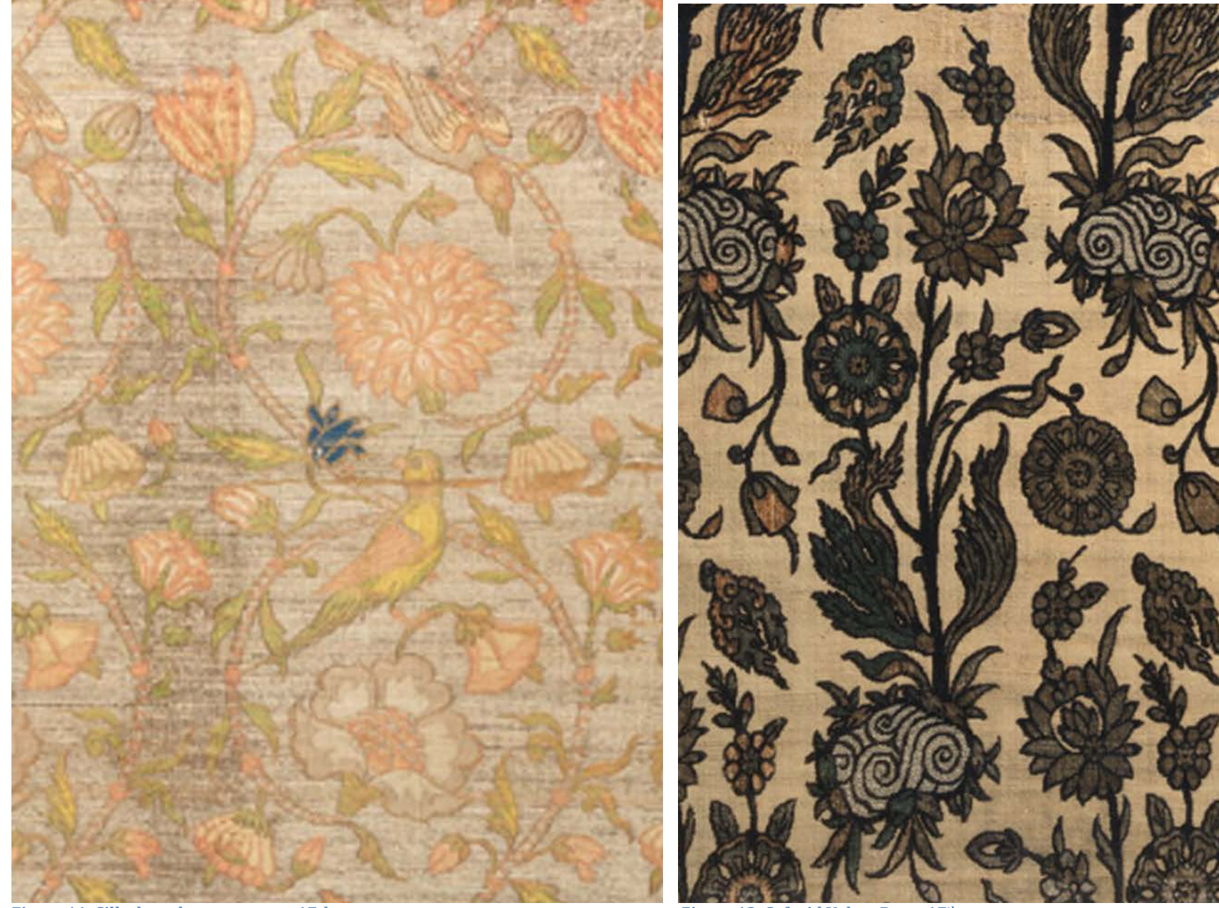
Figure 11: Silk sleeveless vestment , 17th century